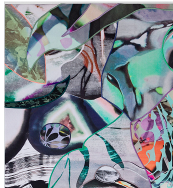
Sophia Belkin Thunder Egg 2024; digitally printed fabric, screenprint, dye, and embroidery on denim 24" x 22" x 1.5" $2000