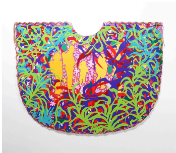
Hoesy Corona Climate Poncho 2024; hand cut vinyl on vinyl fabric, leather cord 23"H x 30"W $3000