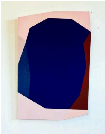
Emma Childs Egress #2 2025; acrylic on canvas 36" x 24" $3200