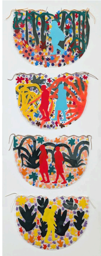
Hoesy Corona Climate Ponchos (small) 2024; hand cut and machine cut vinyl, clear film, leatherette 14"H x 19"W $600 each