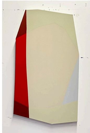
Emma Childs Amplified #3 2025; acrylic on canvas 40" x 22.5" $3300