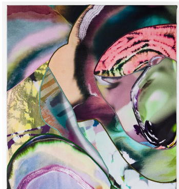
Sophia Belkin Cotyledon 2024; digitally printed fabric, screenprint, dye, and embroidery on denim 24" x 22" x 1.5" $2000