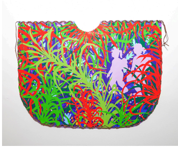
Hoesy Corona Climate Poncho 2024; hand cut vinyl on vinyl fabric, leather cord 26.5"H x 36"W $4000