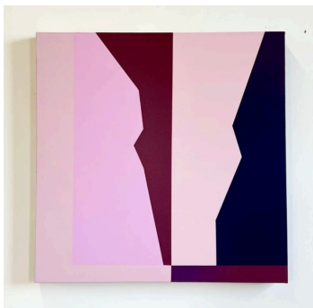
Emma Childs Untitled (ships study) 2025; acrylic on canvas 24" x 24" $2400