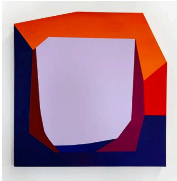
Emma Childs Untitled 2024; acrylic on canvas 24" x 25" $2400