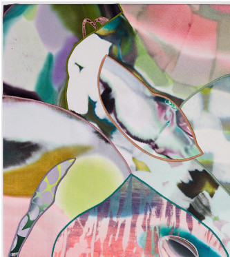
Sophia Belkin Snow Blink 2024; digitally printed fabric, screenprint, dye, and embroidery on denim 24" x 22" x 1.5" $2000