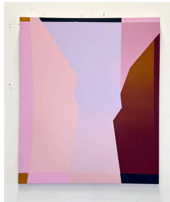
Emma Childs Ships 2025; acrylic on canvas 38" x 32" $3800